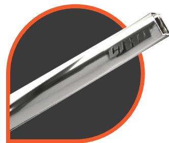
Square Hollow Section - 20 x 20mm to 50 x 50mm