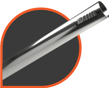
Circular Hollow Section - 1/2" to 2.5"