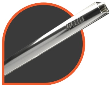
Rectangular Hollow Section - 20 x 40mm to 25 x 50mm